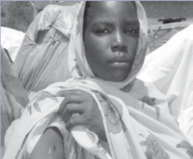
PHOTO STORY : This young girl was attacked and branded on the arm by Janjaweed militia in the remote western Sudan province, Darfur. Many women are not so lucky. They are abducted and raped. Women who have been raped are stigmatized within this society. “A woman who has been raped is like a piece of spoiled meat,” said one man, “Who would have her?”

Sexual abuse: This occurs when a man insists on a sexual relationship without the consent of the woman.